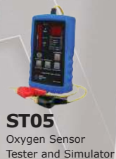
ST05 Oxygen Sensor Tester and Simulator