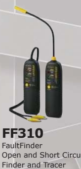
FF310 FaultFinder Open and Short Circuit Finder and Tracer