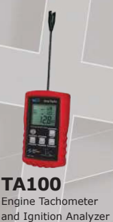
TA100 Engine Tachometer and Ignition Analyzer