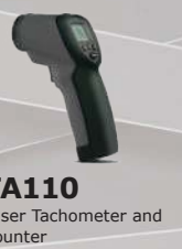
TA110 Laser Tachometer and Counter

General Technologies Corp. #121-7350 72nd Street Delta, BC V4G 1H9 - Canada Toll Free: 800-440-5582 / Tel: 604-952-6699 / Fax: 604-952-6690 www.gtc.ca / info@gtc.ca