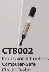
CT8002 Professional Cordless Computer-Safe Circuit Tester