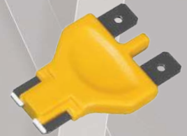
Low Profile Mini