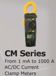
CM Series From 1 mA to 1000 A AC/DC Current Clamp Meters