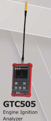
GTC505 Engine Ignition Analyzer